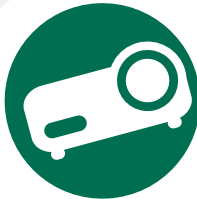
Epson PowerLite Pro Cinema 1080 or 1080 UB

between April 1, 2009 and March 31, 2010 and receive the following: